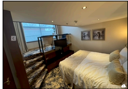
Unusual Cabin with writing desk and window view on Tauck Savor